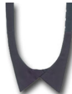
Plain Blue tab