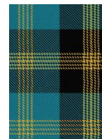
General Choi Pattern tie